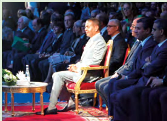
The opening ceremony was held with the presence of H.R.H Prince Moulay Rachid.

Cradle of civilization, science and culture, it has always managed to innovate and challenge itself[...]. Today the Mediterranean must take the lead in building a new way of consumption and production, in innovating in the fight against climate change and more generally sustainable development».